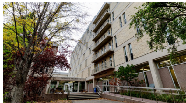
University College Residence

Single or double room; includes meal plan