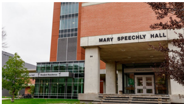
Mary Speechly Hall

Single room with washroom; meal plan included