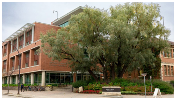
Arthur V. Mauro Residence

The closest residences to the Drake Centre are Arthur V. Mauro, Mary Speechly Hall or Pembina Hall residences. Students living in residence must pay council and programming fees of approximately $150. There is a surcharge for students staying over the December/January holiday break. Historically, the majority of exchange students have lived in Arthur V. Mauro.