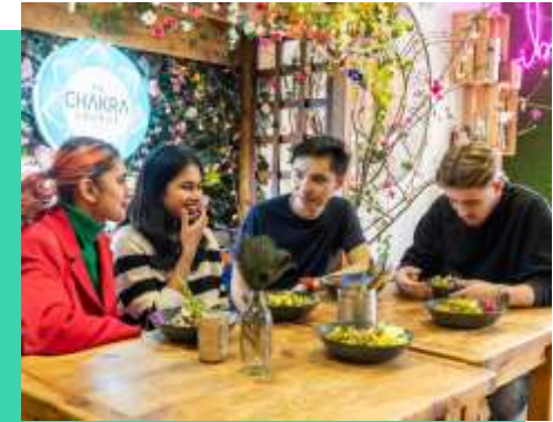
Range of international restaurants, shops and supermarkets