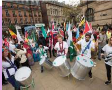
Celebrations of international culture in the University and city