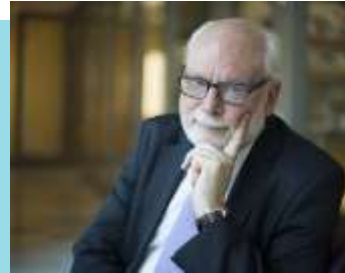
Professor Sir Fraser Stoddard