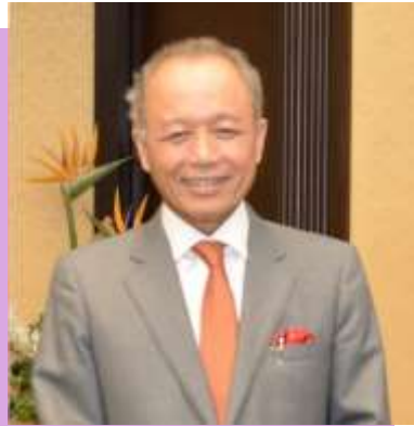
The Rt Hon Dato' Lela Negara Tun Arifin bin Zakaria

Served as Chief Justice of Malaysia 2011-2017