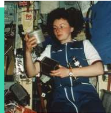
Dr Helen Sharman