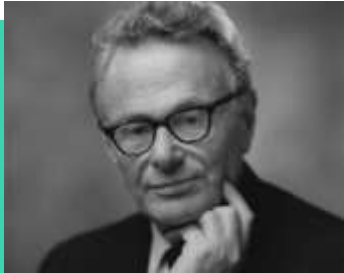
Sir Hans Krebs