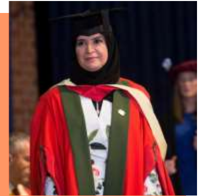
Dr Amal Al Qubaisi

First woman to be elected President and Speaker of the UAE Federal National Council