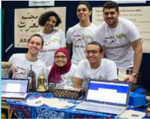
Many student societies to join