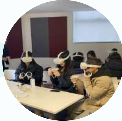
Virtual Reality Lab