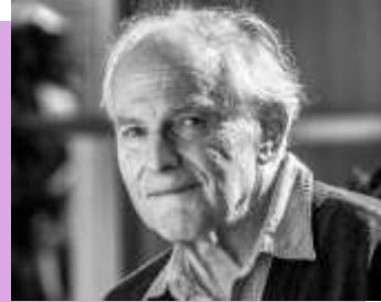
Sir Harry Kroto