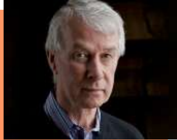
Sir Richard Roberts