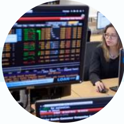
Trading Room with Bloomberg terminals